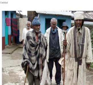
Men arrive to sleep at Ann’s Shelter