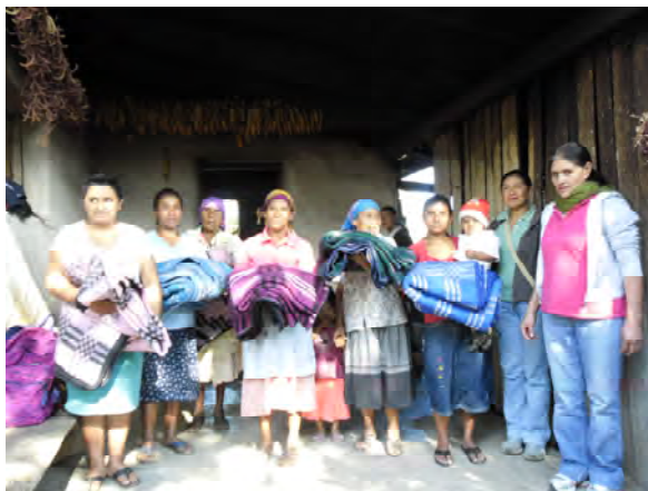
The elderly receiving blankets from Michael’s House