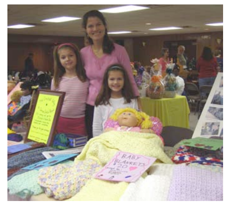
EVANS FAMILY FUND RAISING PROJECT