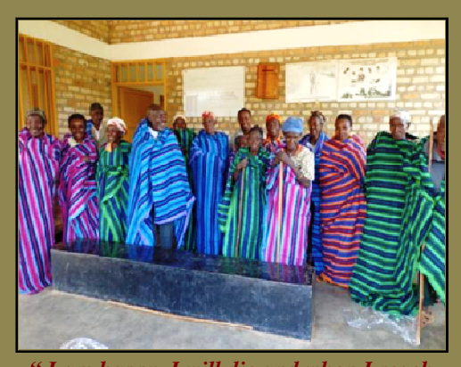
"I am happy, I will die and when I reach Heaven, I will boast that I slept on a mattress in my lifetime."