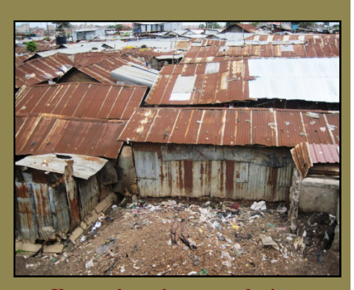
Kenyan slum where many destitute elderly live.