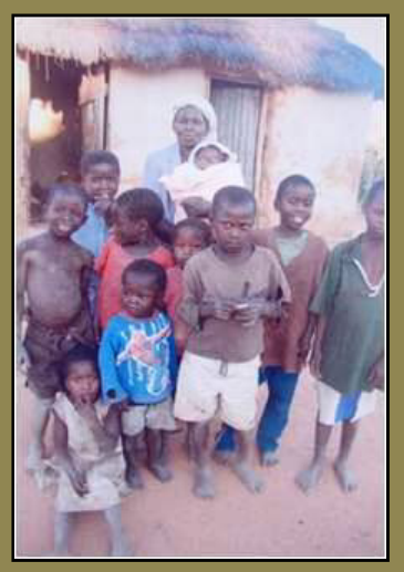
Widowed Zimbabwean grandmother who must care for her grandchildren.